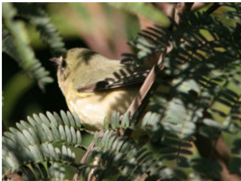
Black-throated Blue Warbler