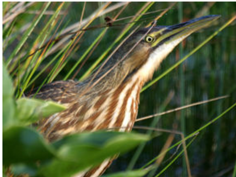
American Bittern

1 was reported at South end of Ocean Beach on Aug 22 (Paul Saraceni).