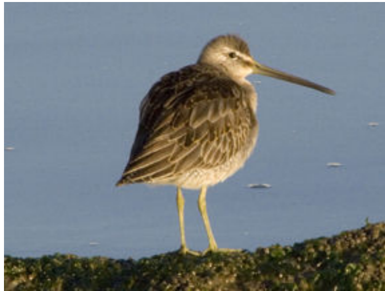
Long-billed Dowitcher