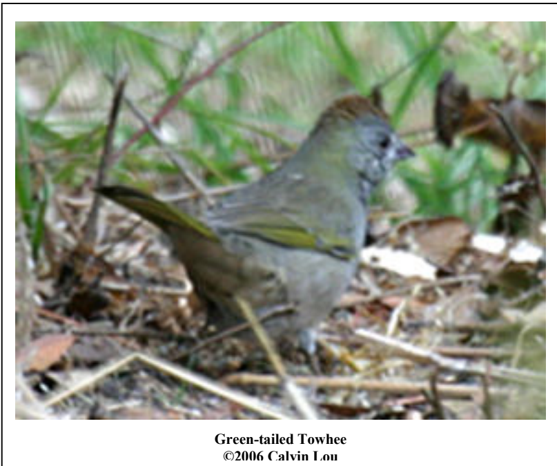
Green-tailed Towhee