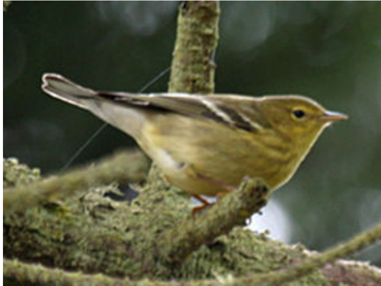
Blackpoll Warbler