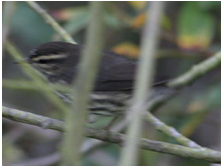
Northern Waterthrush