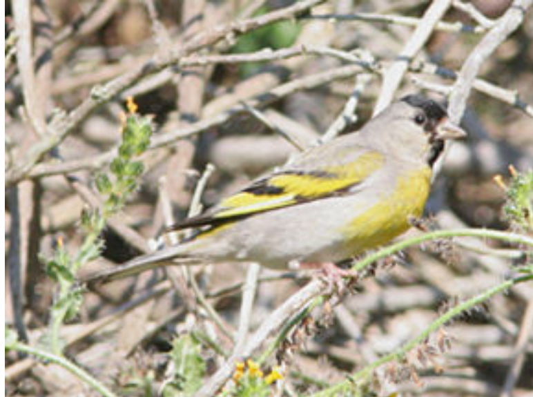
Lawrence's Goldfinch

2006 was a very good year for this irruptive species. However, their origins are a bit of a mystery? Did they breed here or did they disperse as a result of the Del Puerto Canyon fire? The total number of individuals is somewhat confusing from the reports below. 3 males and one female type were reported at Presidio Hills/Quail Commons, Presidio on Jul 21 (Matt Zlatunich,