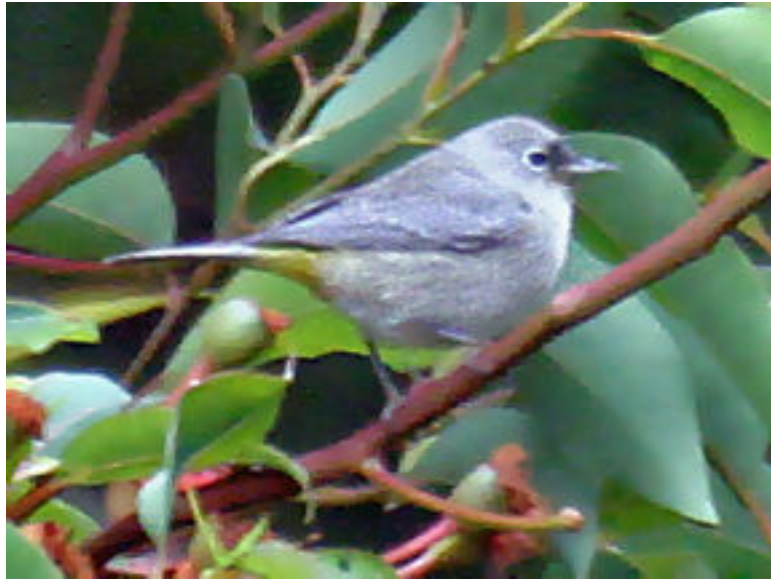
Virginia's Warbler