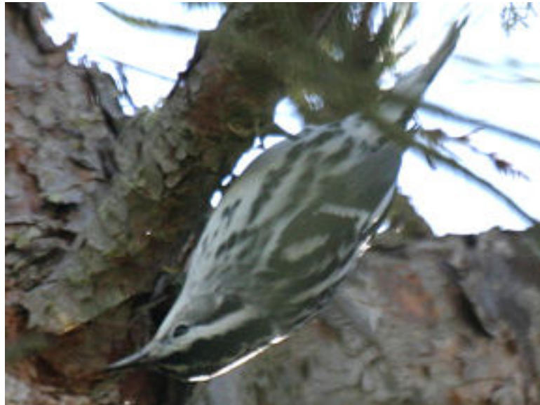
Black-and-White Warbler