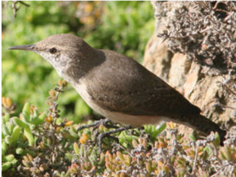
Rock Wren