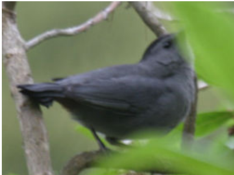
Gray Catbird