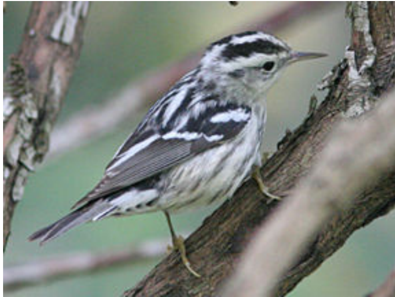
Black-and-White Warbler